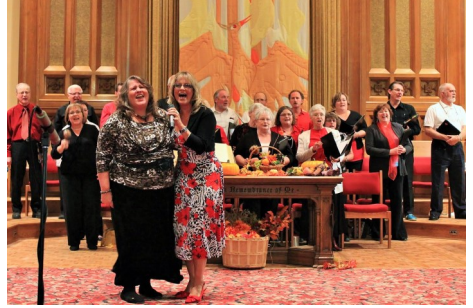
Jazz Sunday 2010