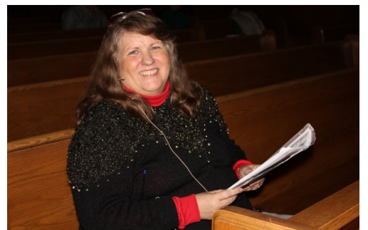
Living Christmas Gift Director 2012