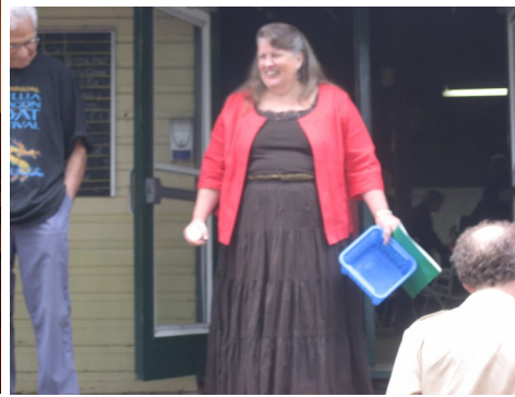
Sparrow Lake 2009