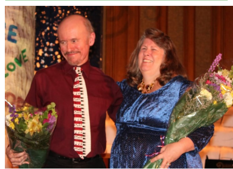
Living Christmas Gift—2012