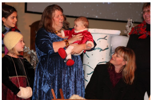
Living Christmas Gift—2012