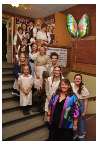
Anne of Green Gables 2015 Anne of Green Gables Cast 2015